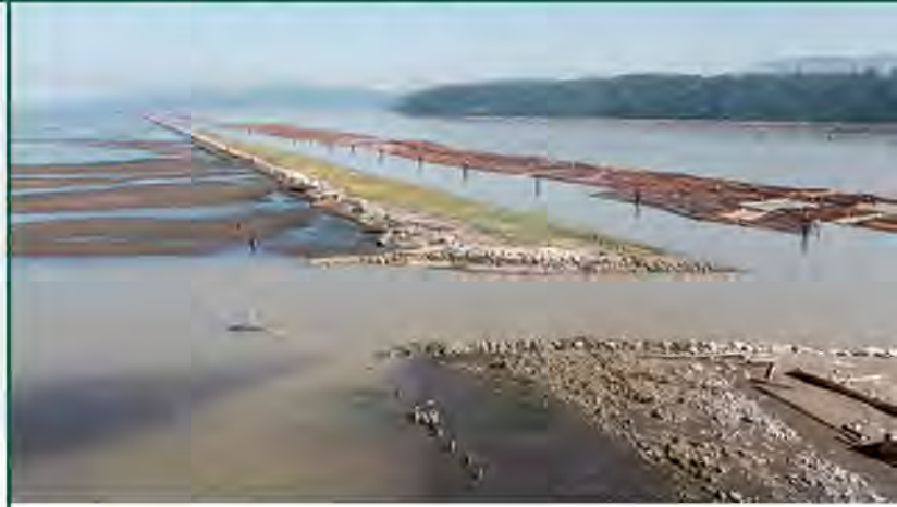
Jetty breach #1 constructed in February 2022.