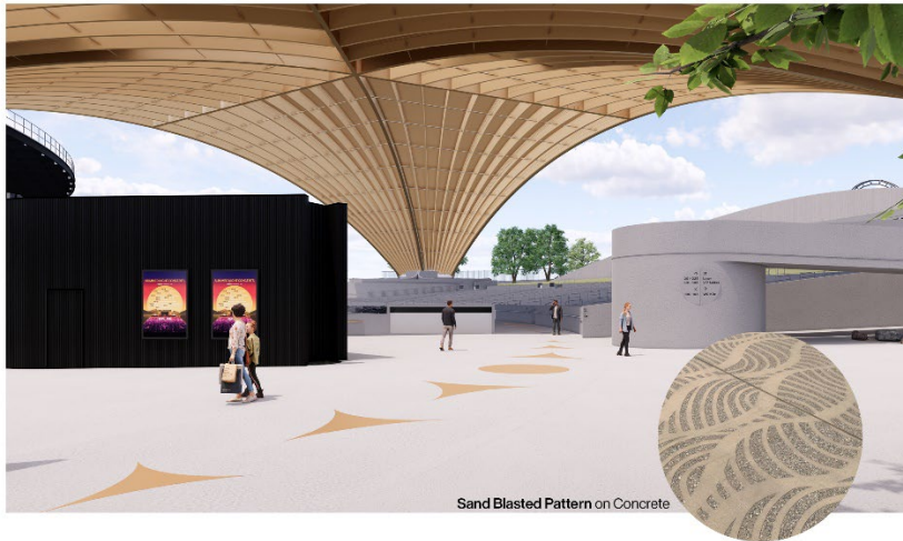
OPPORTUNITY 1 MIDDLE CROSS AISLE - PATTERN ON CONCRETE