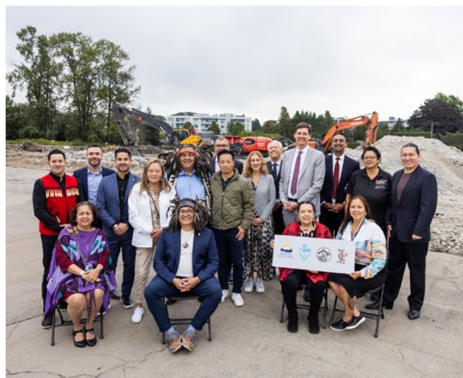
Celebrating the announcement of the Attainable Housing Initiative at the Heather Lands, September 19, 2024.

More information about this initiative, including quotes from Nations leadership and photos from the announcement, can be found here .