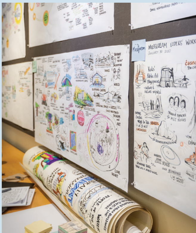
Input from MST Nations' Community Members shaped the planning and design of the Heather Lands.